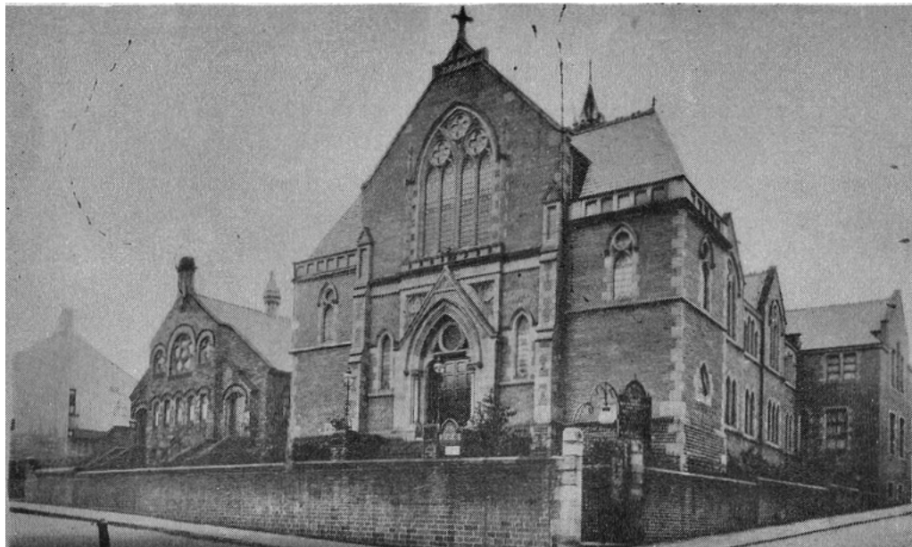
Figure 5.3: The old and the new church shortly after being opened in 1908