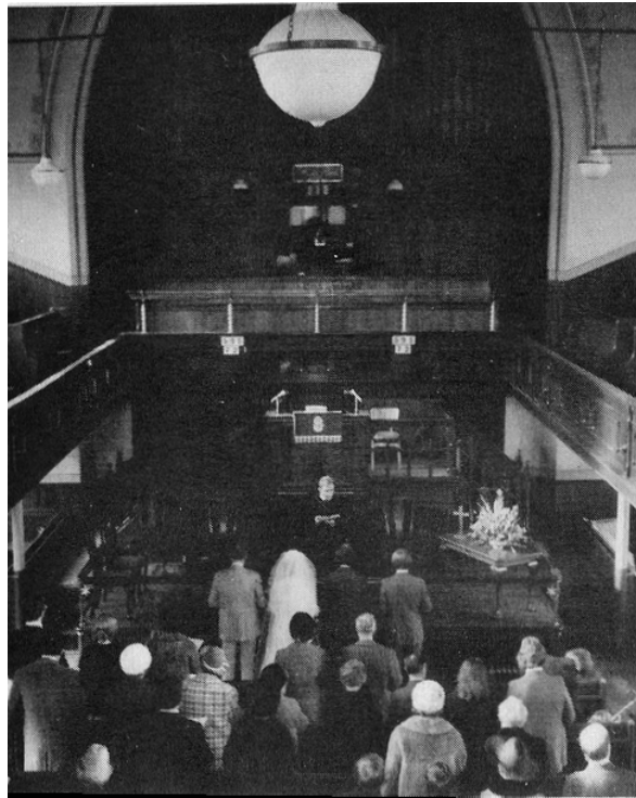
Figure 9.1: The interior of the church as it was before modifications