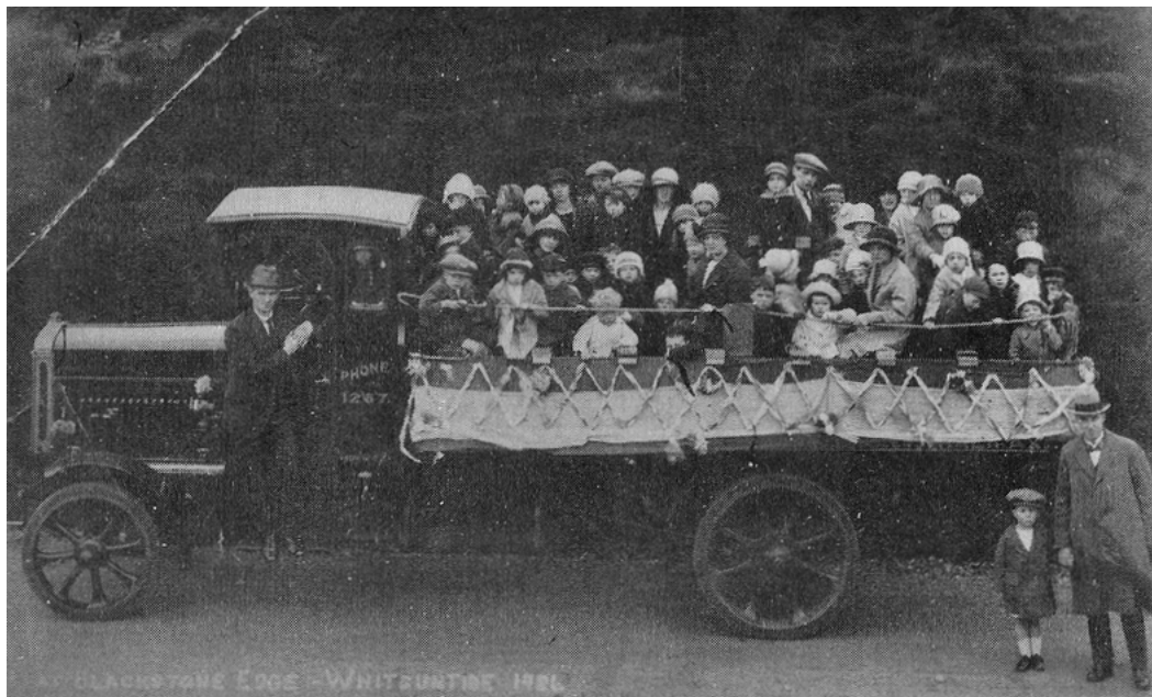
Figure 6.2: Whitsuntide Treat 1924