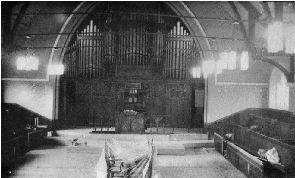
Figure 9.2: The re-built sanctuary almost completed 1977

Another valued activity is the Church family 'Day' or 'Weekend' held in various churches, colleges and centres, every year since 1972. Held in September, it is a fine preparation for the demands and possibilities of a new church year.