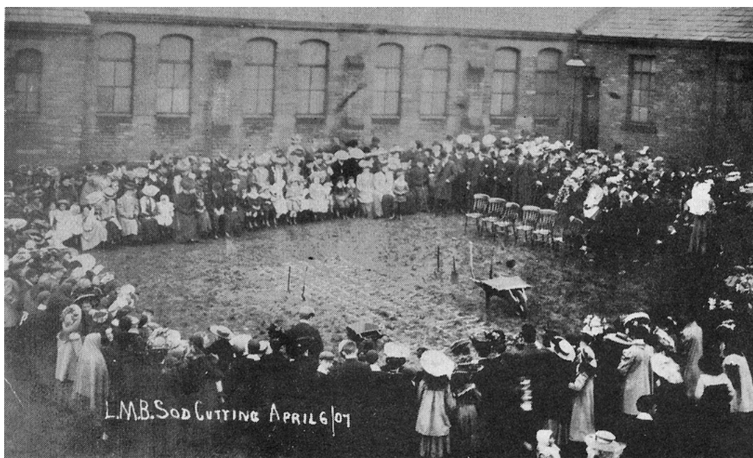
Figure 5.2: Sod cutting ceremony at the second church April 6th, 1907